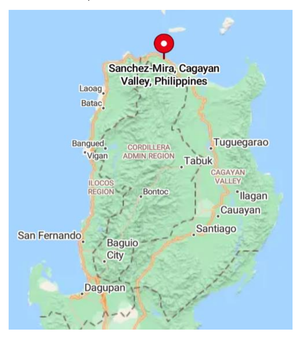
Fig. 1. Map of Cagayan

2024 along with employment status and number of years in service was gathered from the Human Resource Management Office (HRMO) of the university, the perception of the employees of Cagayan State University-Sanchez Mira with regards the current state and status of the Records Management Practices, the challenges associated with the records management system/practice encountered by the university and types of interventions to be implemented to records management compliance among CSU-SM employees was based from the survey questionnaire which was distributed to the involved respondents in records management activities by the researcher, as well as those employees whose performance and productivity are related to the state of records and the collected data or results of the study was reviewed for future viable interventions and recommendations.