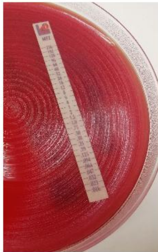
Fig. 3. Epsilometry test of F. vaginae growing in Mueller-Hinton agar supplemented with blood. The microorganism is able to grow all along the stripe containing metronidazole (resistant, CMI>256)