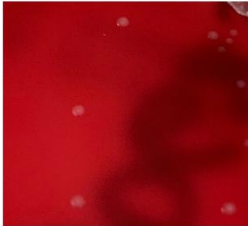
Fig. 2. Detail of F. vaginae colony in Columbia blood-agar